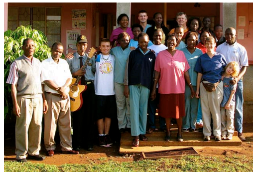
Left: Clinic staff and volunteers on the front steps of the clinic in July, 2007.

If you are interested in getting involved with the work of CPG you may make a financial contribution or volunteer your skills to build capacity and enable the community to increase its ability to sustain change and to continue to make improvements. To make a donation or volunteer your time and skills, check our web-page for areas of priority at www.caringpartners.ca .