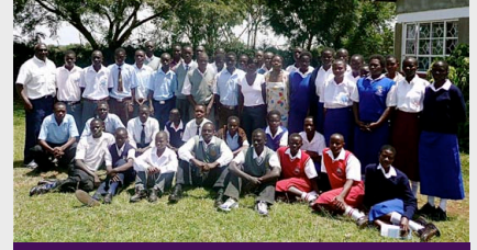
Above: Some of the sponsored high school students home from school for the summer in August, 2008.