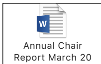
Annual Chair Report March 20